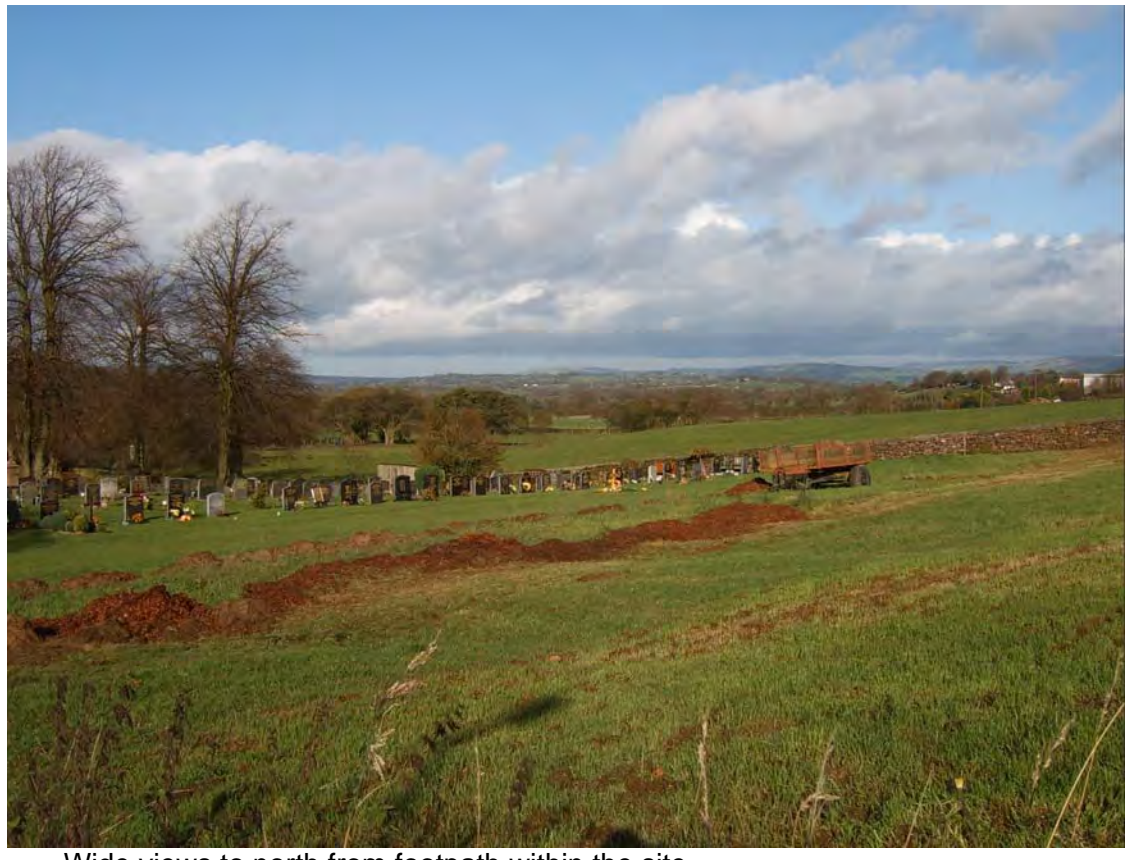
Wide views to north from footpath within the site