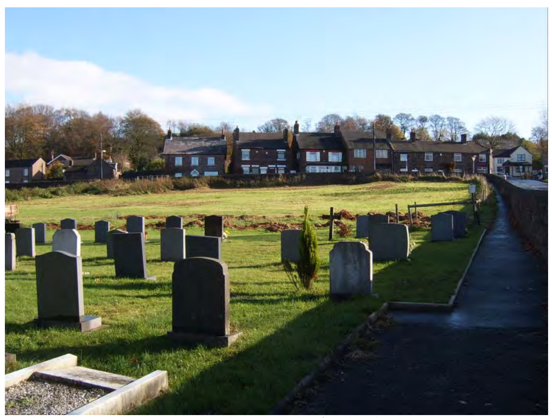
Views to east across graveyard to properties fronting A520