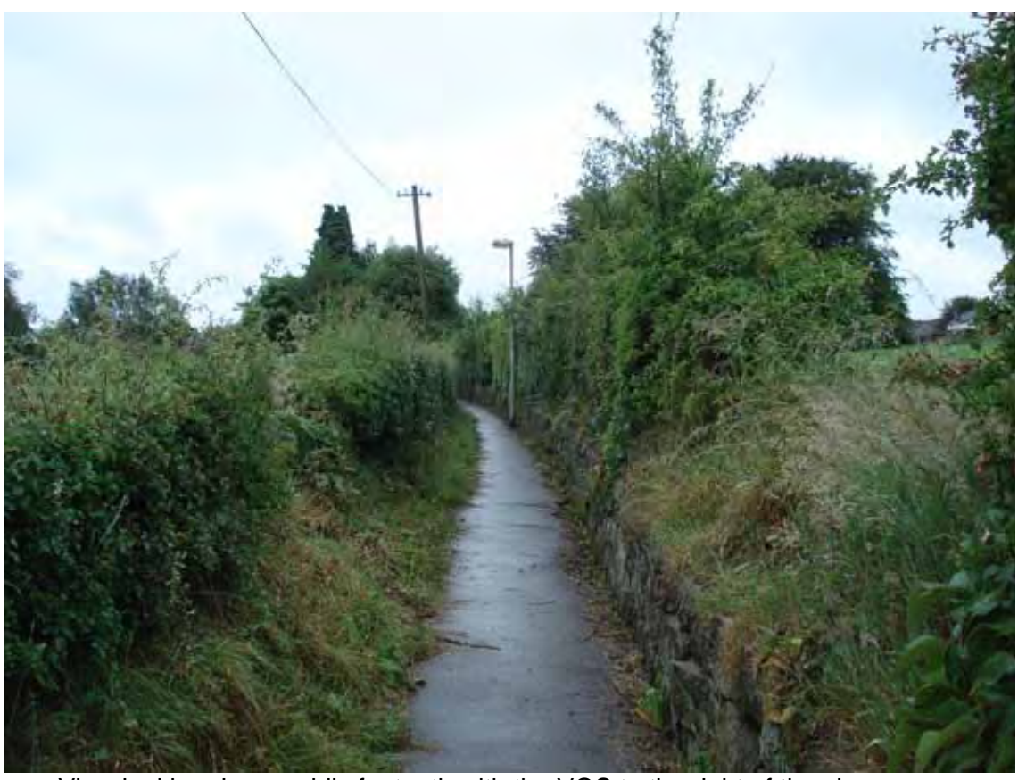
View looking down public footpath with the VOS to the right of the view