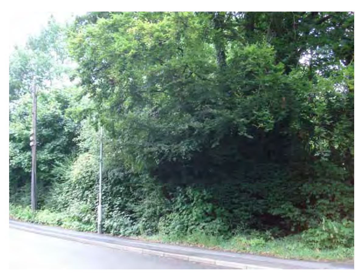
View from private road off Clay Lake Road to the east adjacent to the woodland