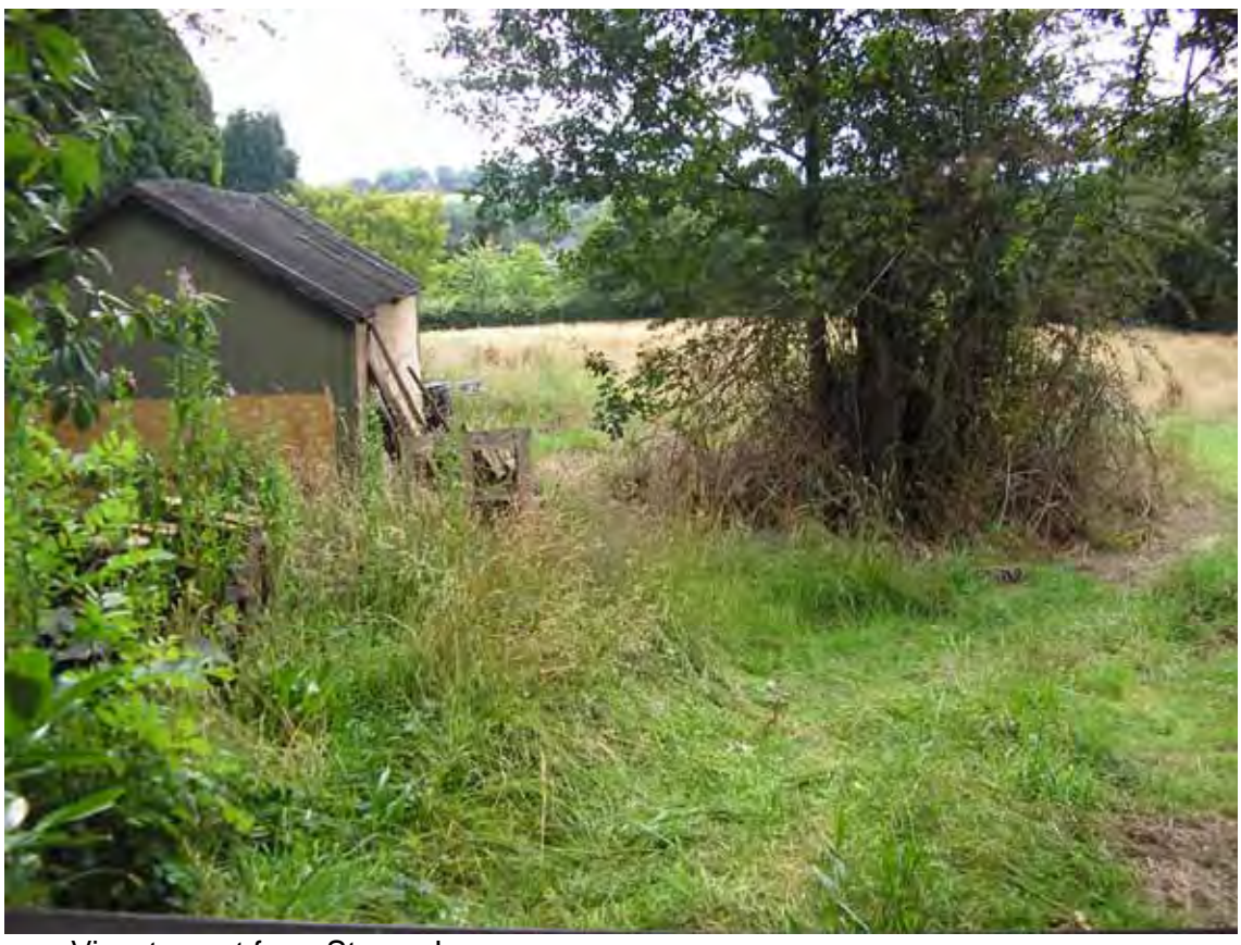
View to east from Stoney Lane