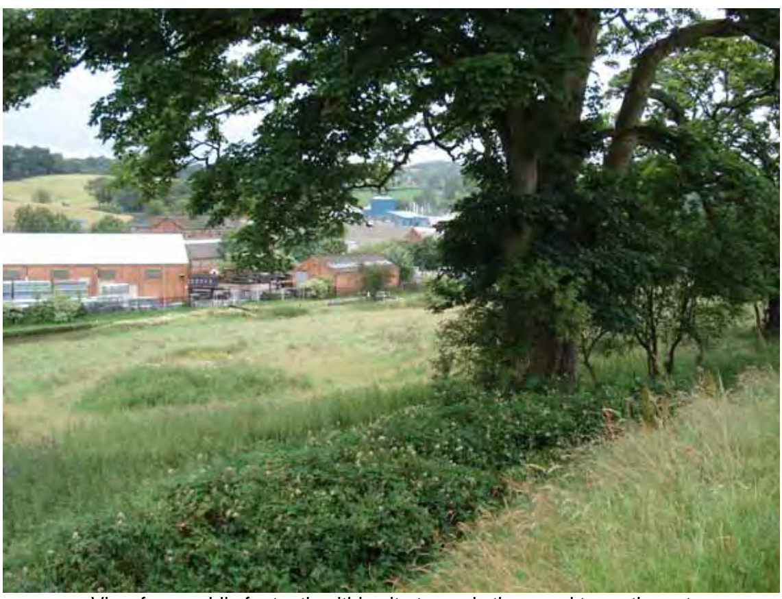
View from public footpath within site towards the canal to north east