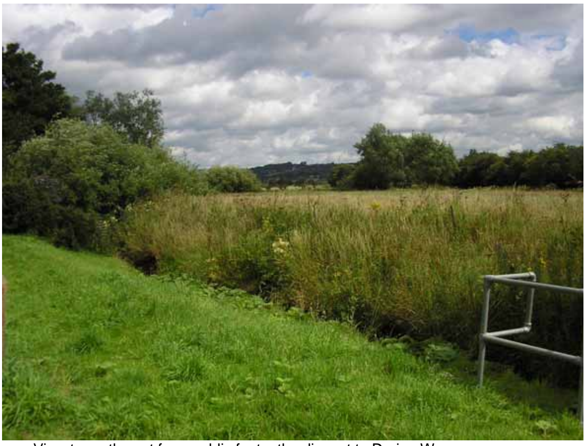
View to north east from public footpath adjacent to Dorian Way