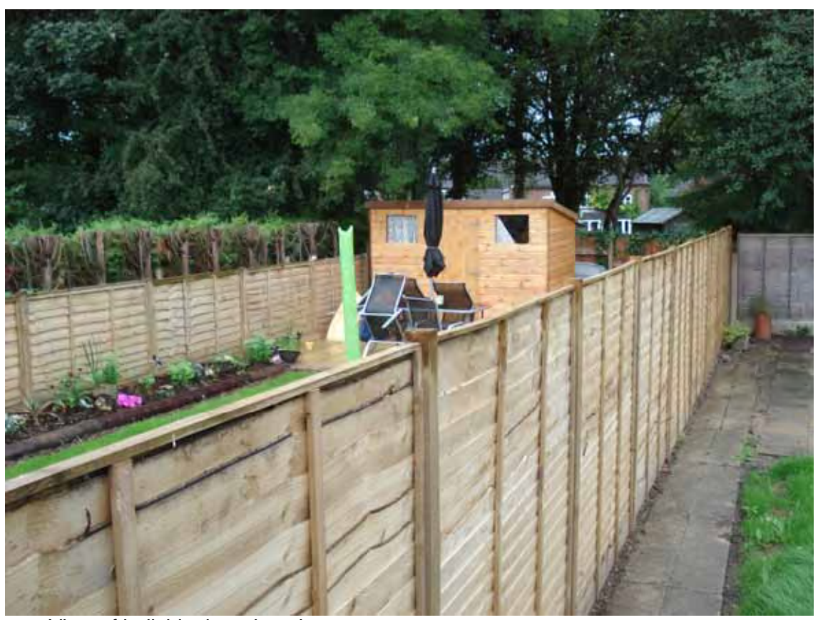
View of individual garden plots