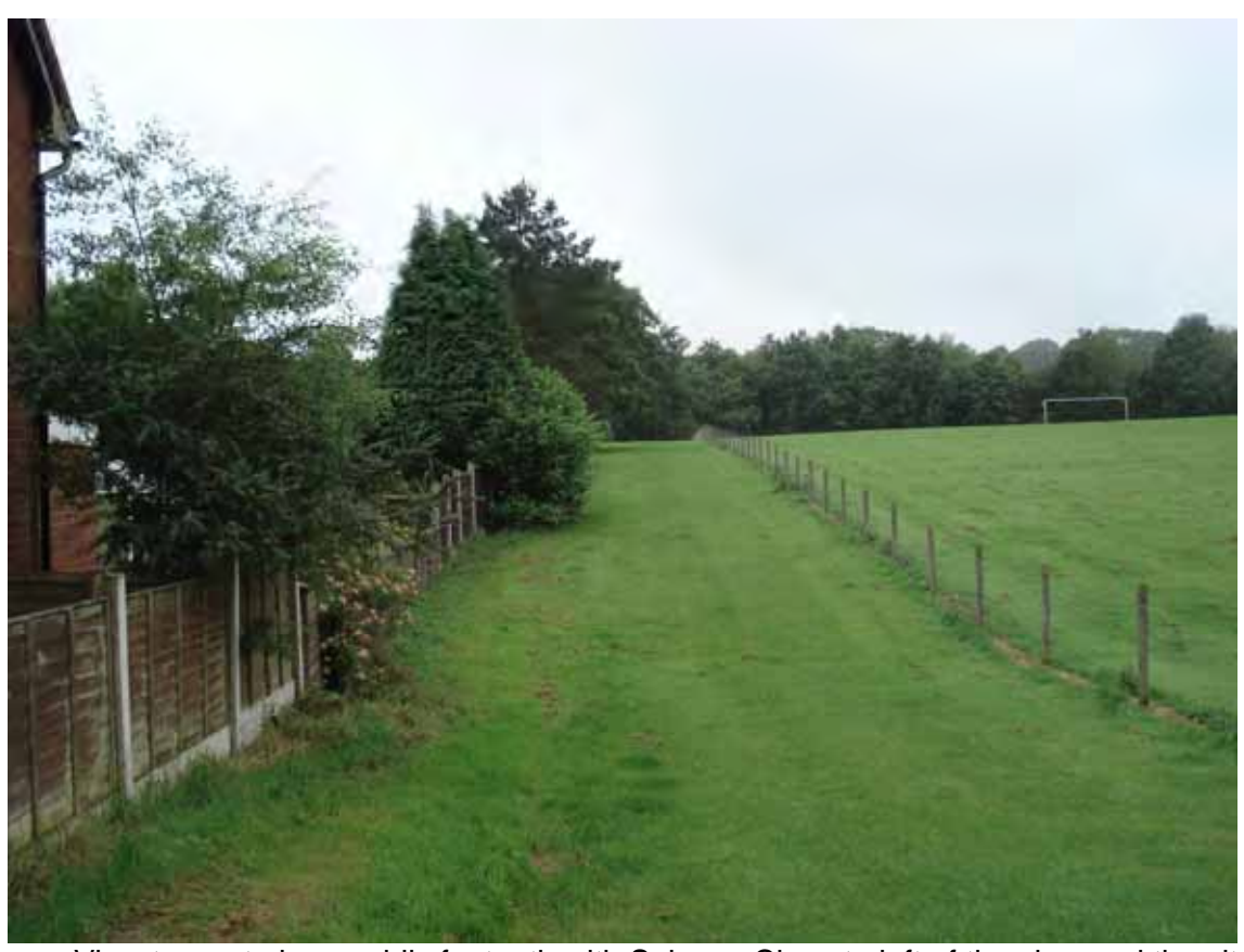
View to west along public footpath with Spinney Close to left of the view and the site in the distance