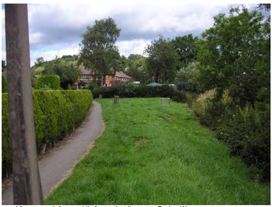
View to north from public footpath adjacent to Dorian Way