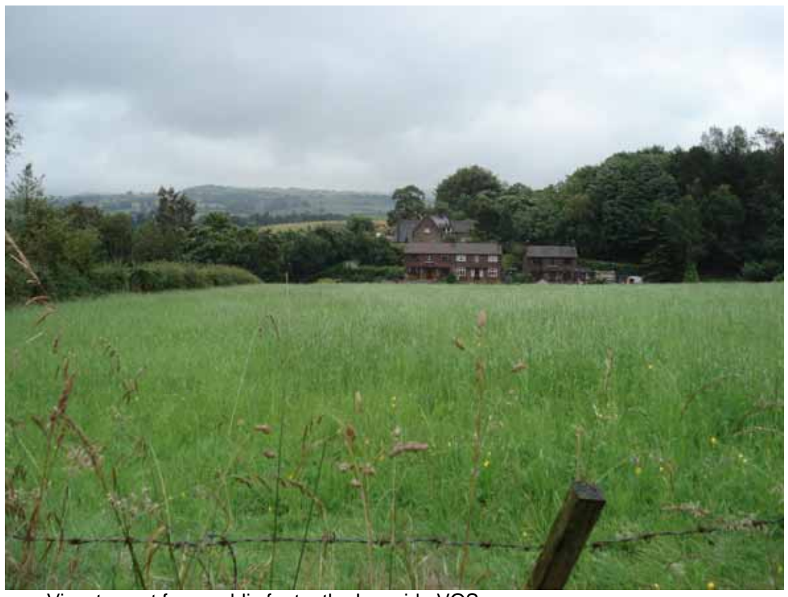
View to east from public footpath alongside VOS