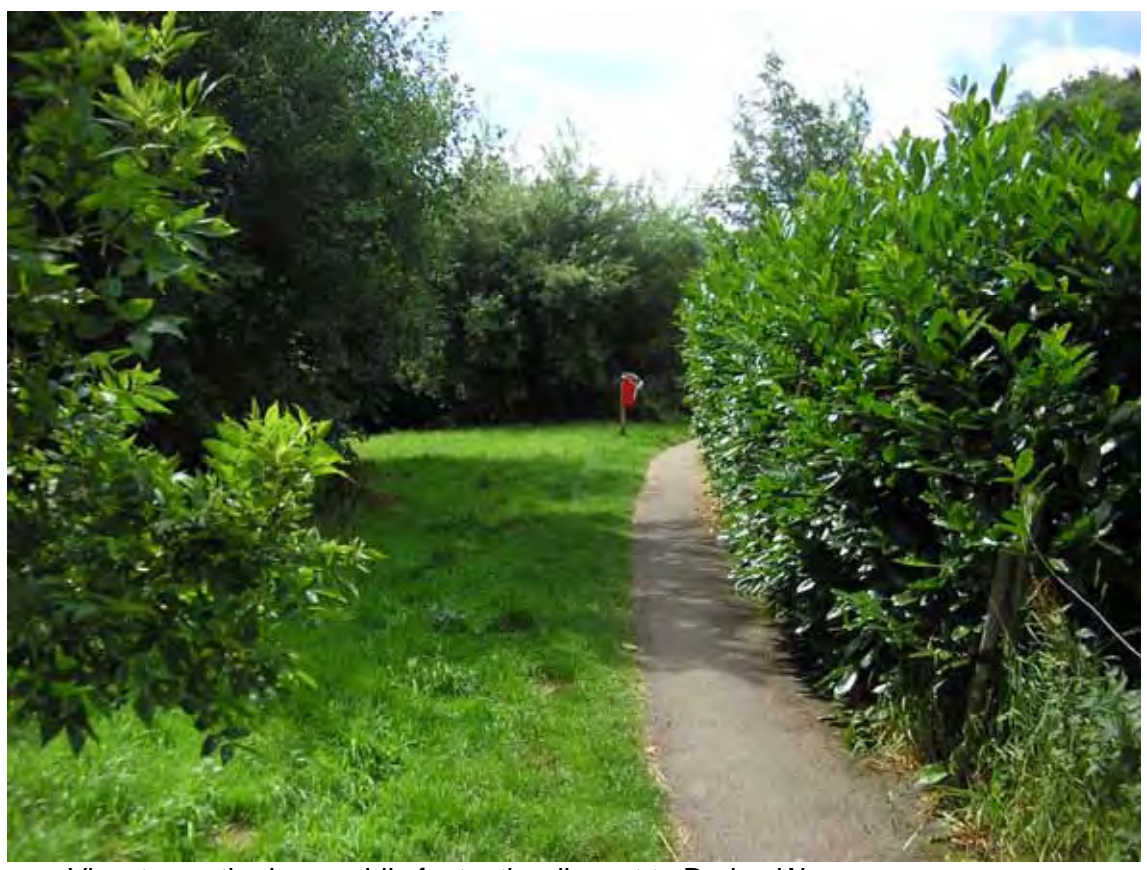
View to south along public footpath adjacent to Dorian Way