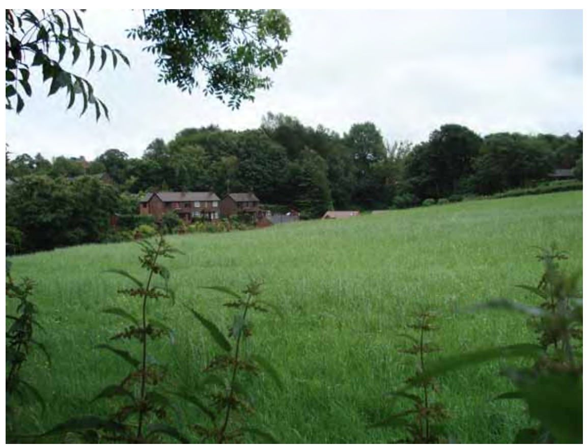
View from public footpath along northern boundary of the site