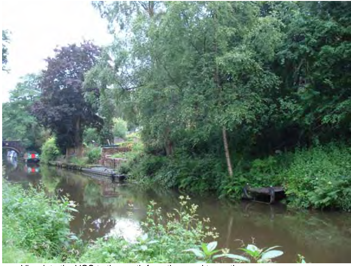
View into the VOS to the south from the canal towpath