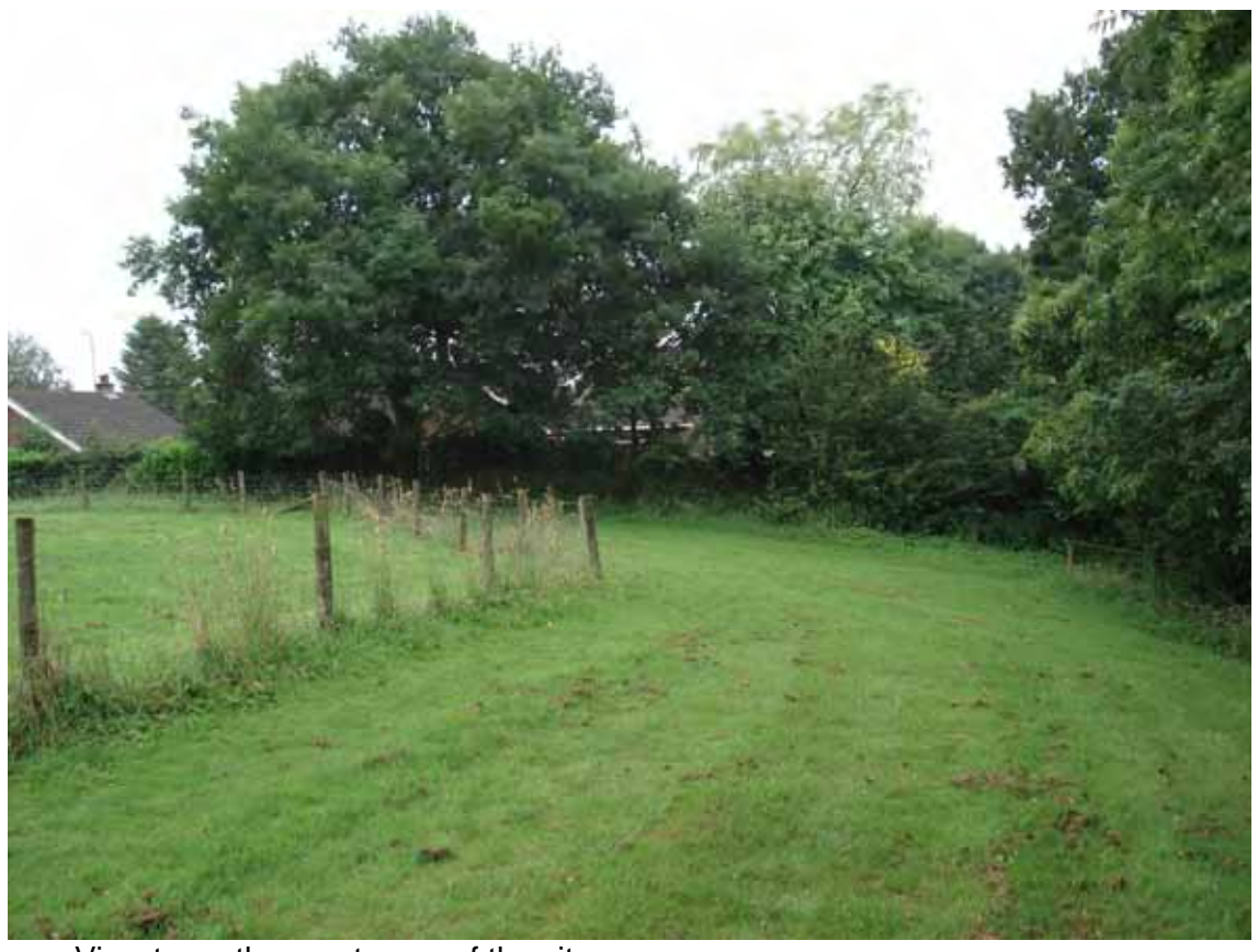
View to northern entrance of the site