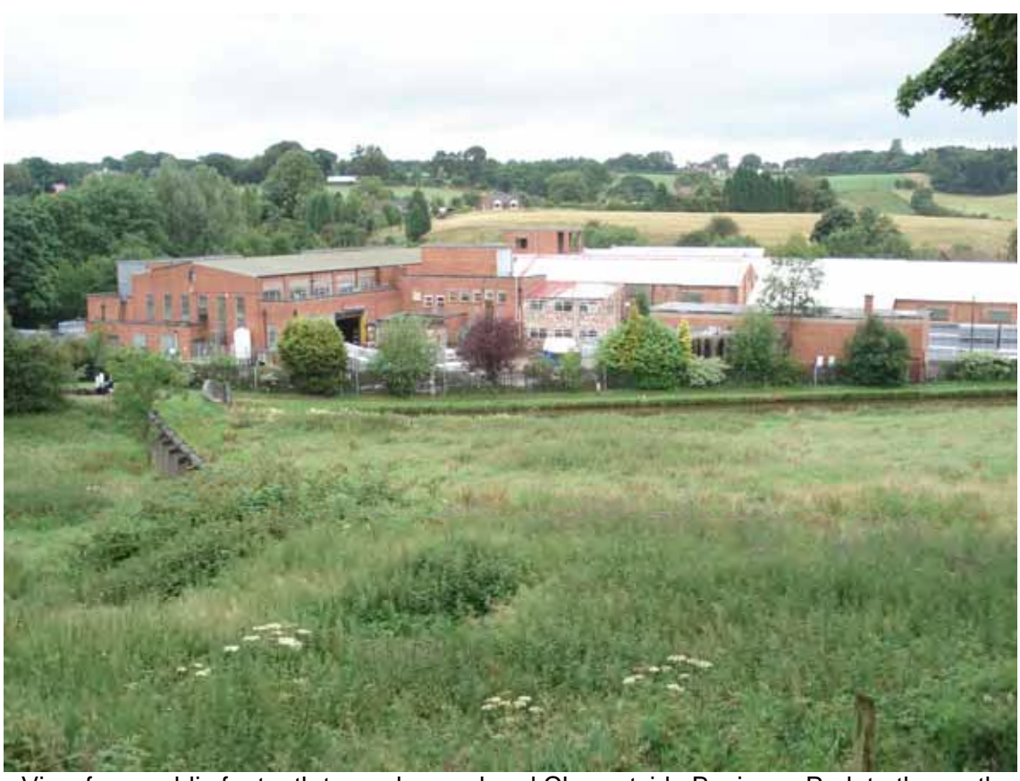
View from public footpath towards canal and Churnetside Business Park to the north