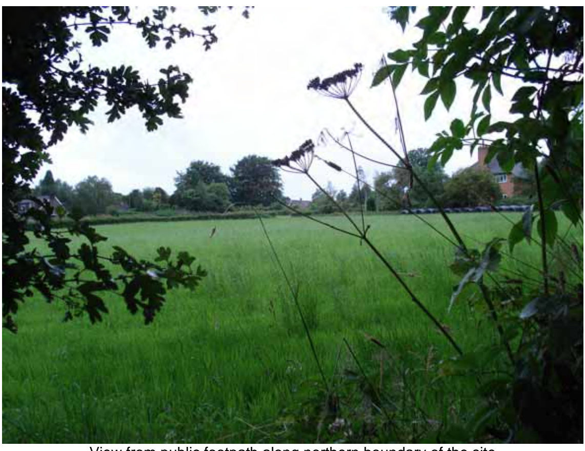
View from public footpath along northern boundary of the site