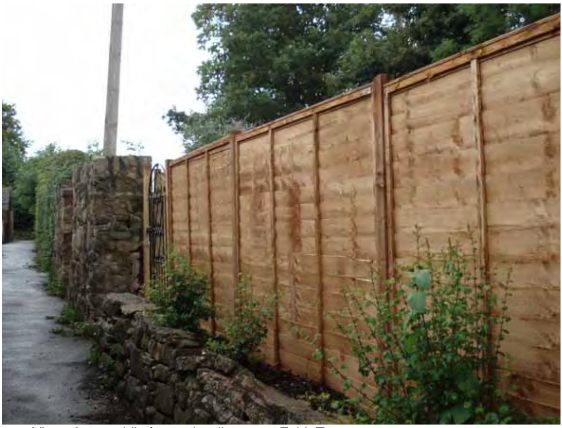
View along public footpath adjacent to Fold Terrace