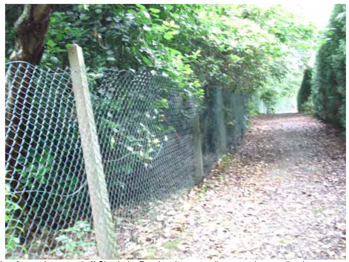
View from private road off Clay Lake Road to the east adjacent to the woodland