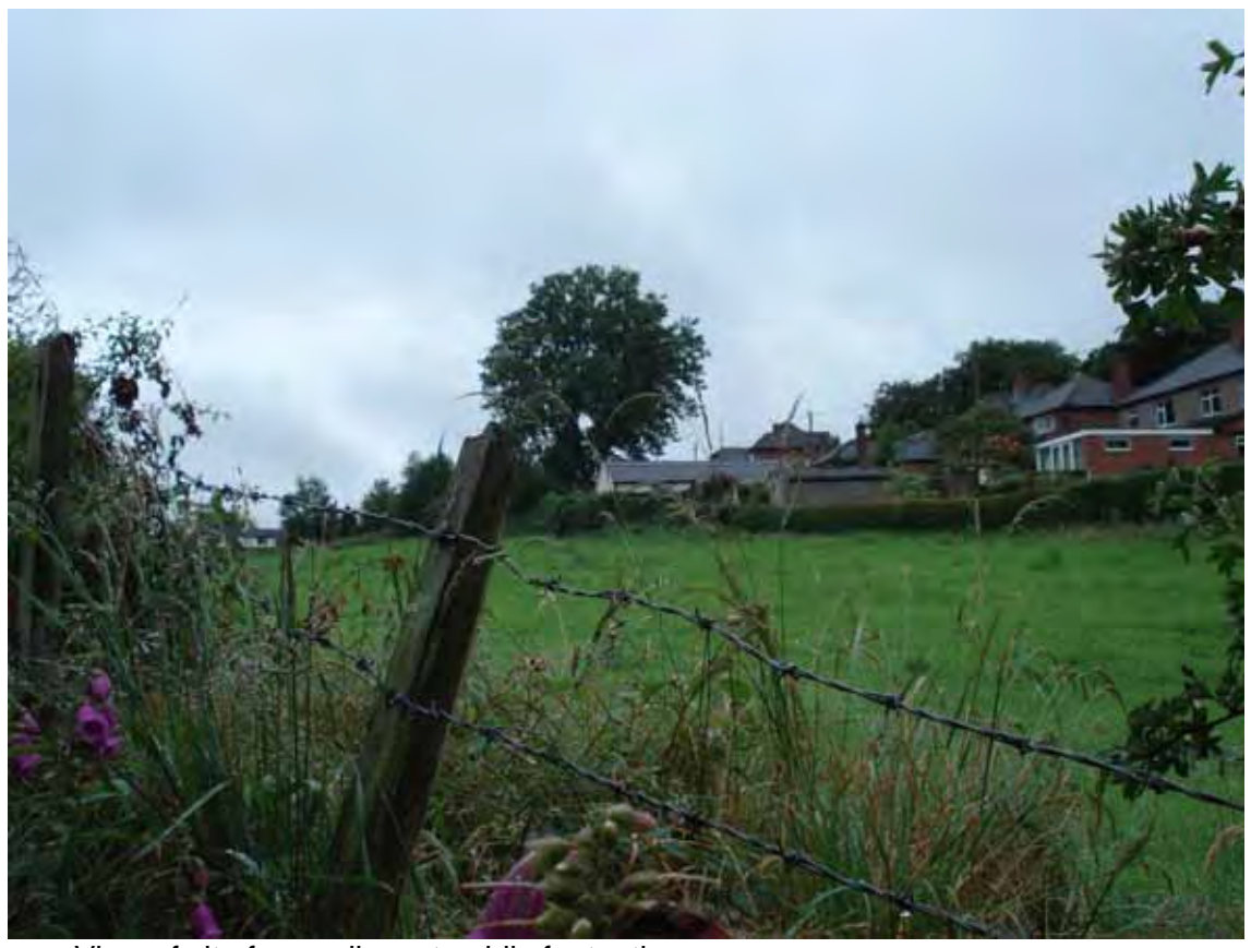
View of site from adjacent public footpath