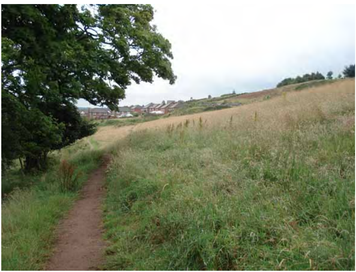
View to east along footpath towards recent residential development in the distance