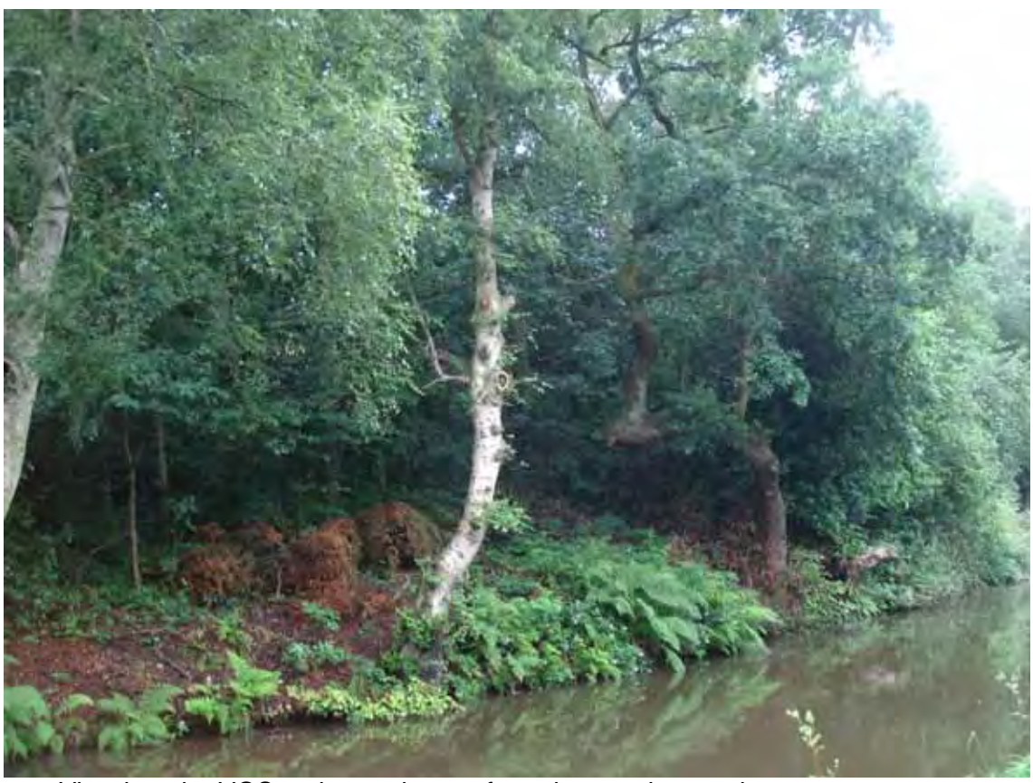
View into the VOS to the north west from the canal towpath