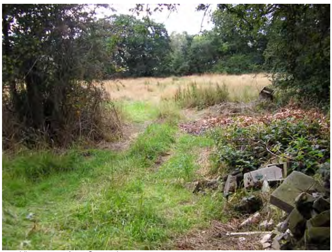
View to east from Stoney Lane